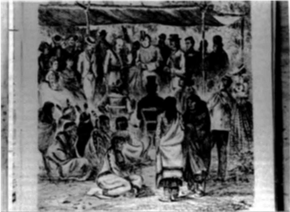
The signing of Treaty Number One at Lower Fort Garry, August 1871.