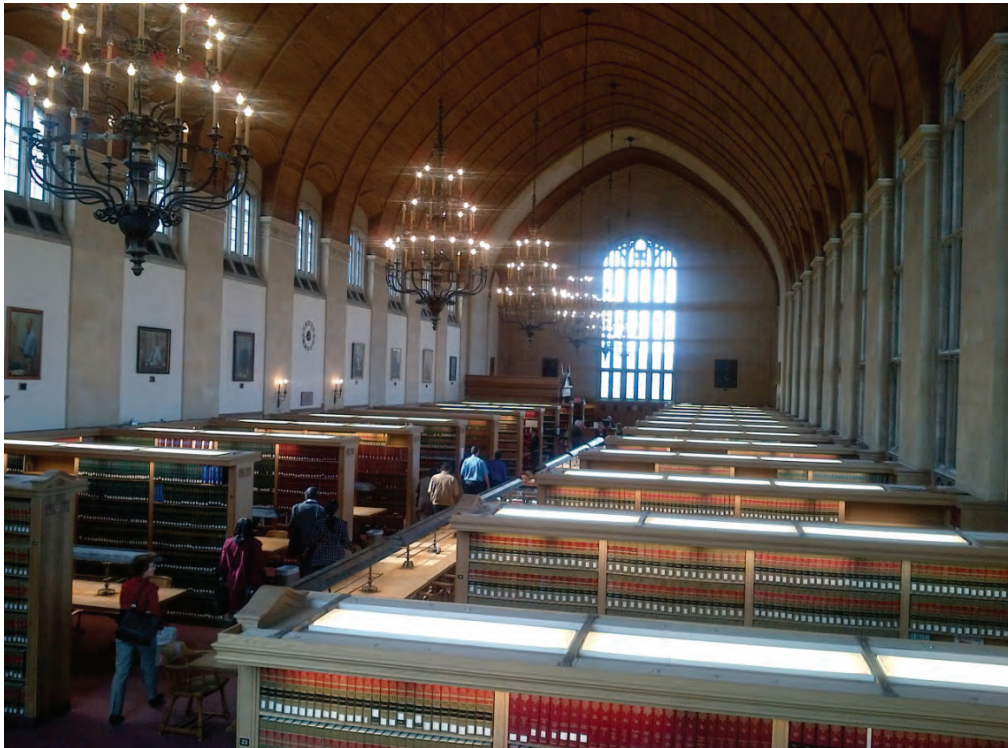
Cornell Law Library Reading Room

The opportunity given to me as a recipient of the Janine Miller Fellowship has been a fulfilling experience. It opened a lot of windows of opportunity! In addition to librarians, I met a lot of other professionals who had a lot to share and are willing to continue networking and exploring.