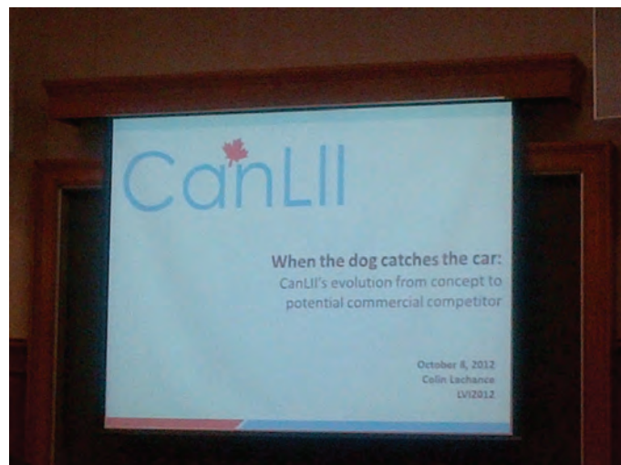
Colin Lachance Presentation Slide

This presentation was based on a project that took an inventory of legal resources in all formats, including print, microform, CD-ROM, and online from federal, state, county,