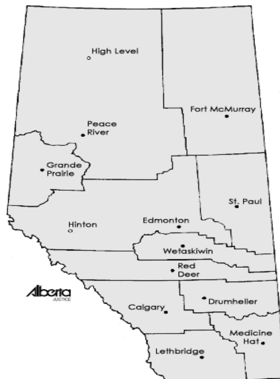
Figure1 – Alberta Judicial Districts

Overall, Alberta's high school completion rate is 80%. However, this number is driven by the large proportion of people living in Edmonton and Calgary. Every other region of