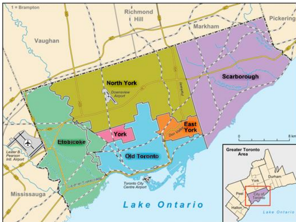
Figure 1: City of Toronto: Map of the pre-amalgamated municipalities, 1967-1997 40