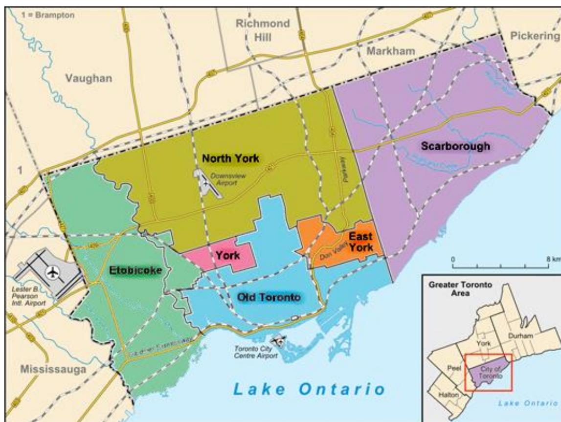
Figure 1: City of Toronto: Map of the pre-amalgamated municipalities, 1967-1997 40